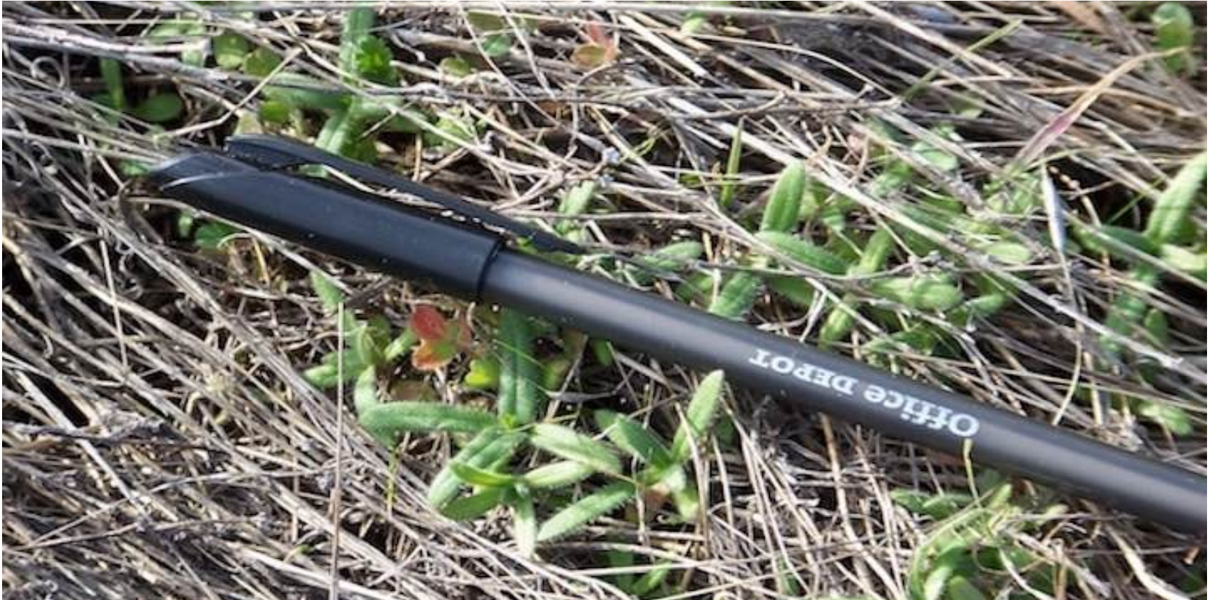
Wildflower seedlings coming up in Yellow star thistle thatch- Russian Ridge Preserve.

This new method depends on a remarkable discovery, that can be found in most of California's grasslands—Underneath the weeds are dozens of species of dormant 100-250 year old native seeds!