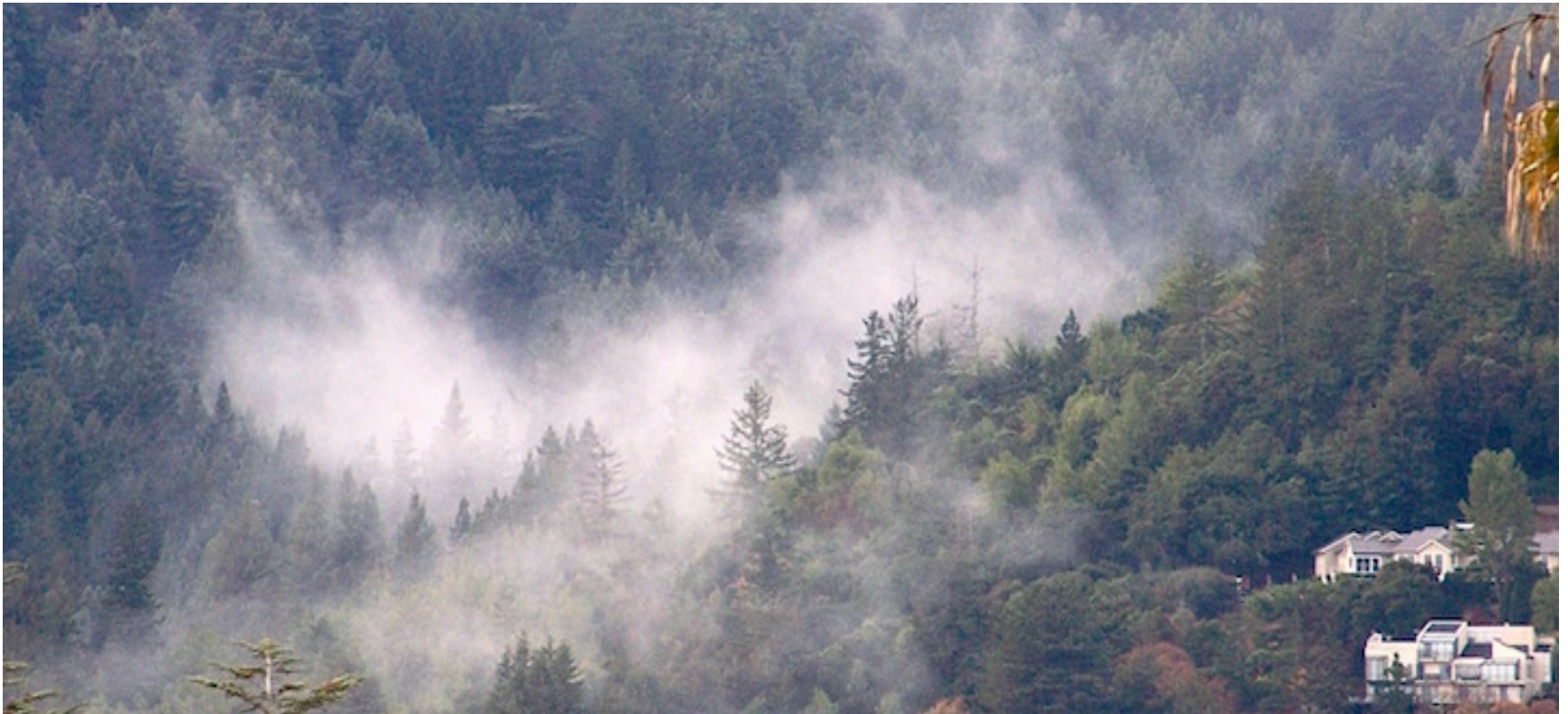
Photo of the mountains above Woodside, California--a new rain cloud being born.

And keep an eye out for the native Pseudomonas host plants , that produce the rain clouds in California—Made visible right after a rain shower, the bacteria gets airborne and a new cloud is born. GOOGLE: “Discover magazine, clouds, bacteria” for the 2012 article. Nobody knows what these plants are yet, that produce our rain!