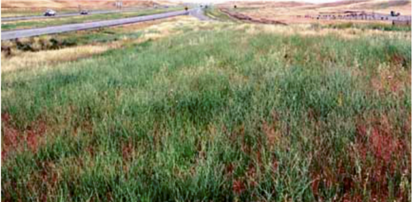
Junction I-505 and Avenue 14