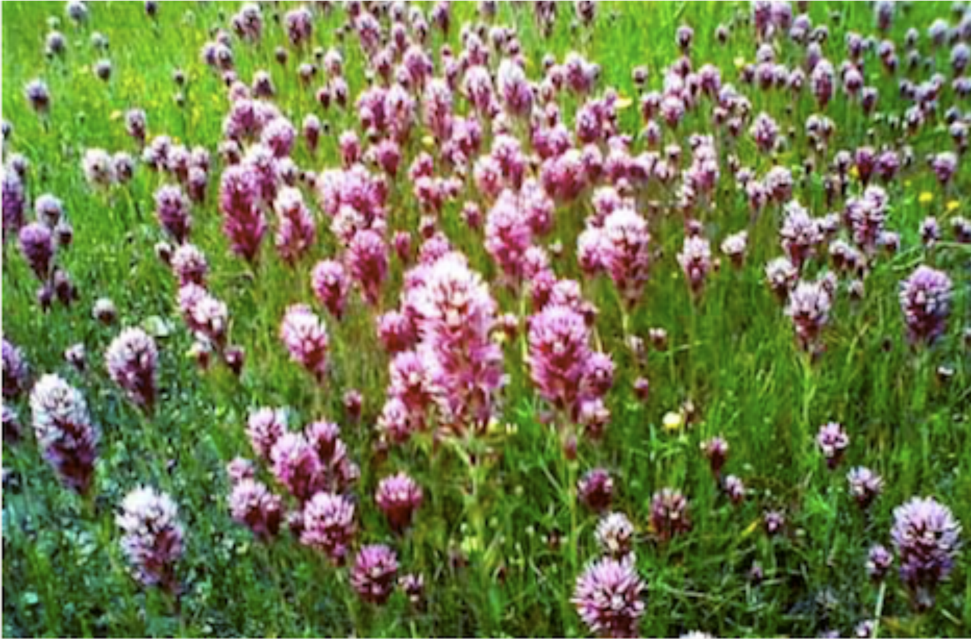
Title: "Wish You were Here--Owls Clover on the California hillsides